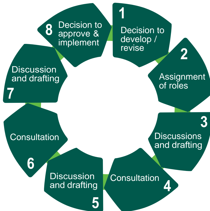
Figure 1: The basic process for development or review/revision of a normative document

The focus of this paper is on those 70 normative documents that fall under the scope of FSC- PRO-01-001, thus excluding the NFSS and CWRA documents. Annex 1 provides a breakdown of these 70 normative documents, categorized under five (5) core themes and an explanation of the six (6) core FSC document types.